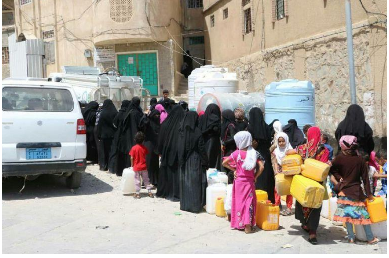
Water Poverty as a Result of the Houthi Siege of Taiz

The Forum for Development and Human Rights Dialogue Report